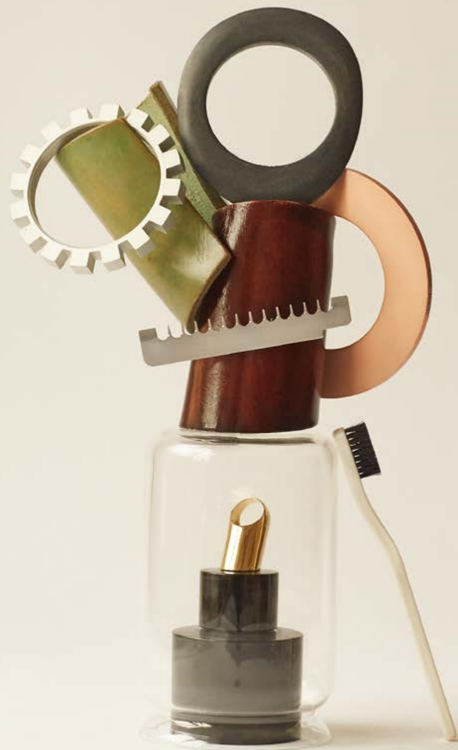
EXTRACT FROM STILL LIFES ARTICLE.