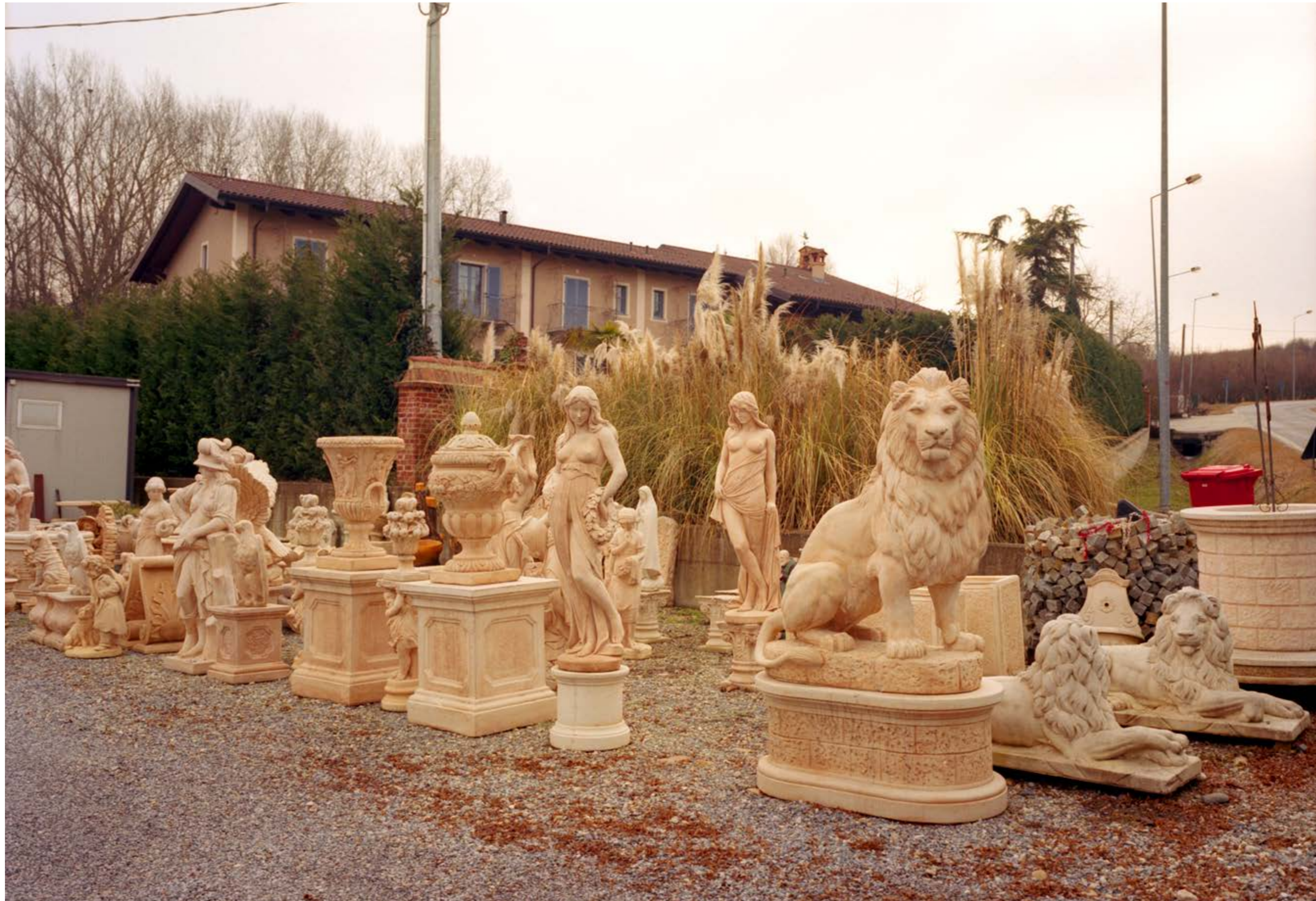
EXTRACT FROM STILL LIFES ARTICLE.