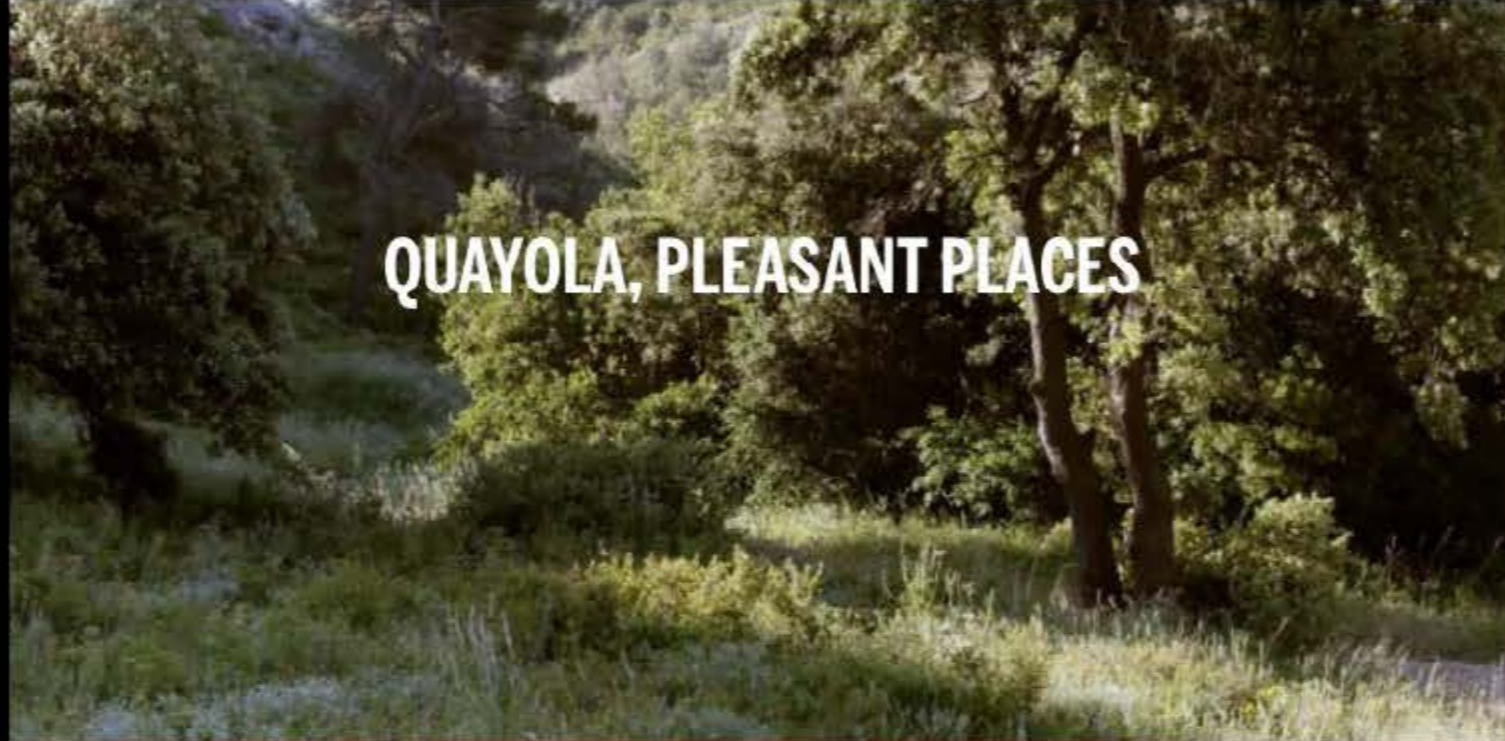
QUAYOLA, PLEASANT PLACES