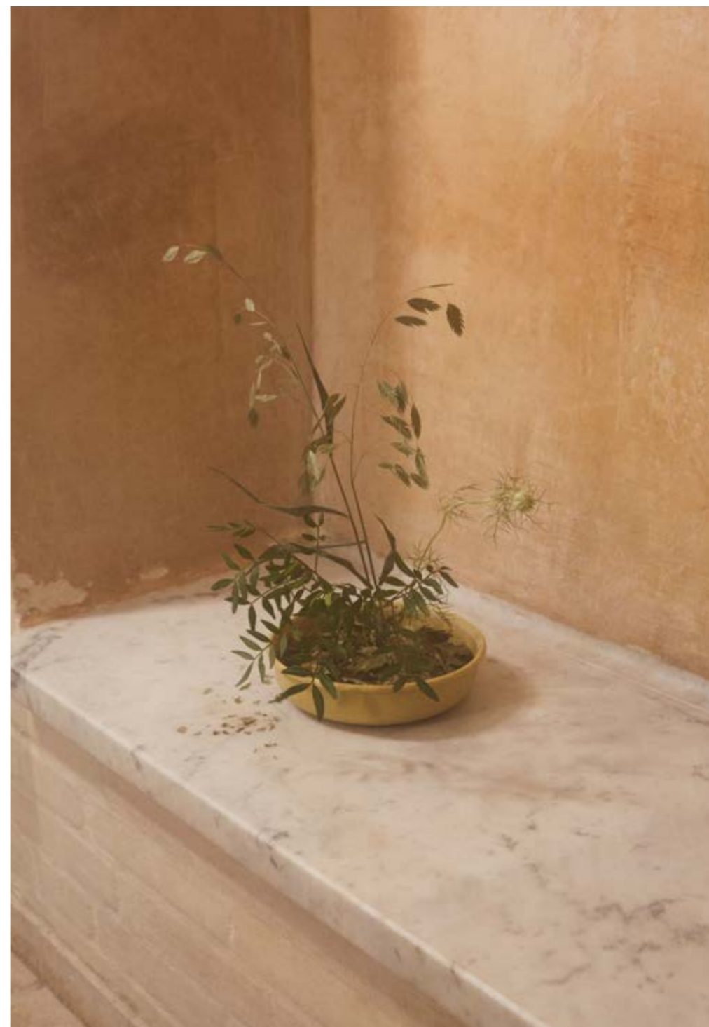
EXTRACT FROM STILL LIFES ARTICLE.