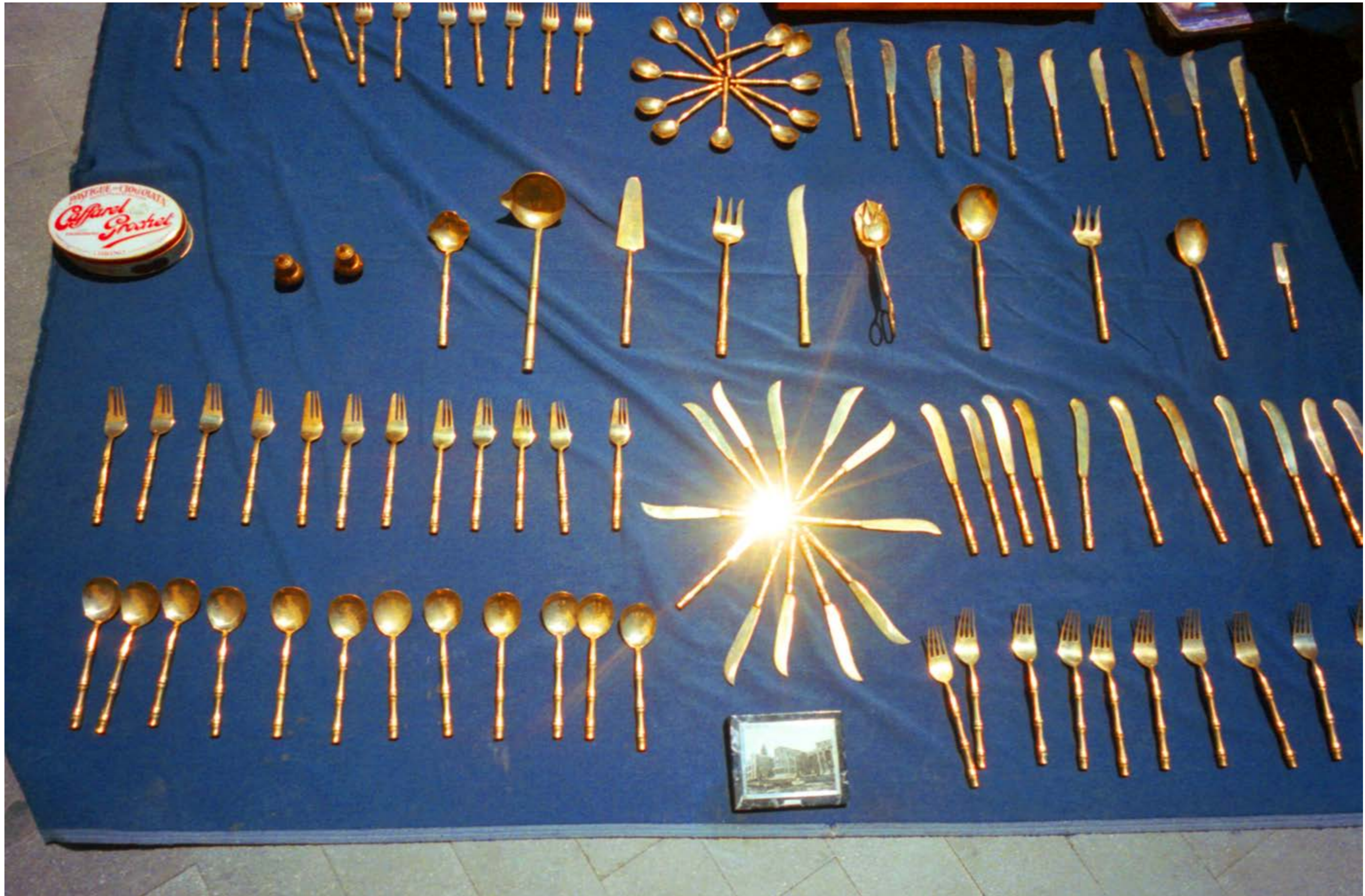
EXTRACT FROM STILL LIVES ARTICLE