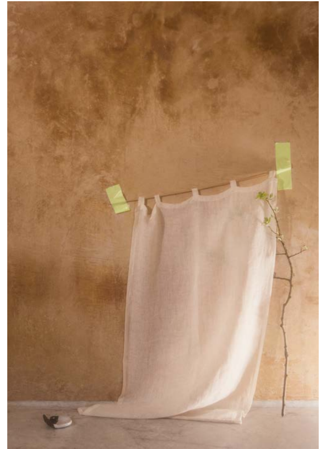
EXTRACT FROM STILL LIFES ARTICLE.