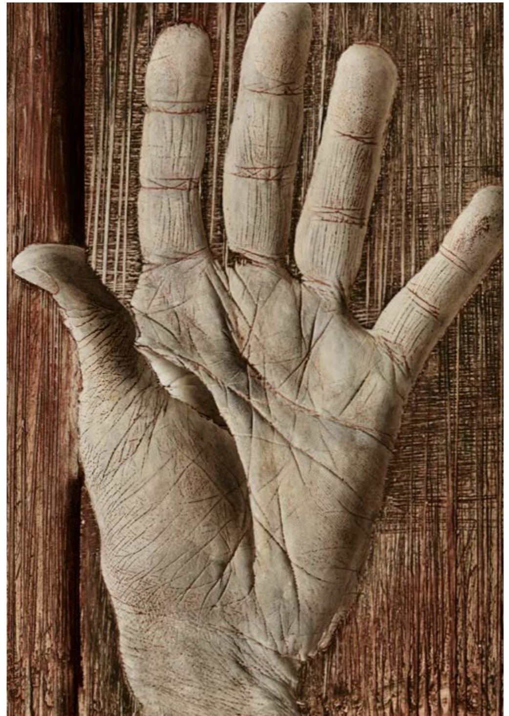
EXTRACT FROM SUBIRACHS ARTICLE.