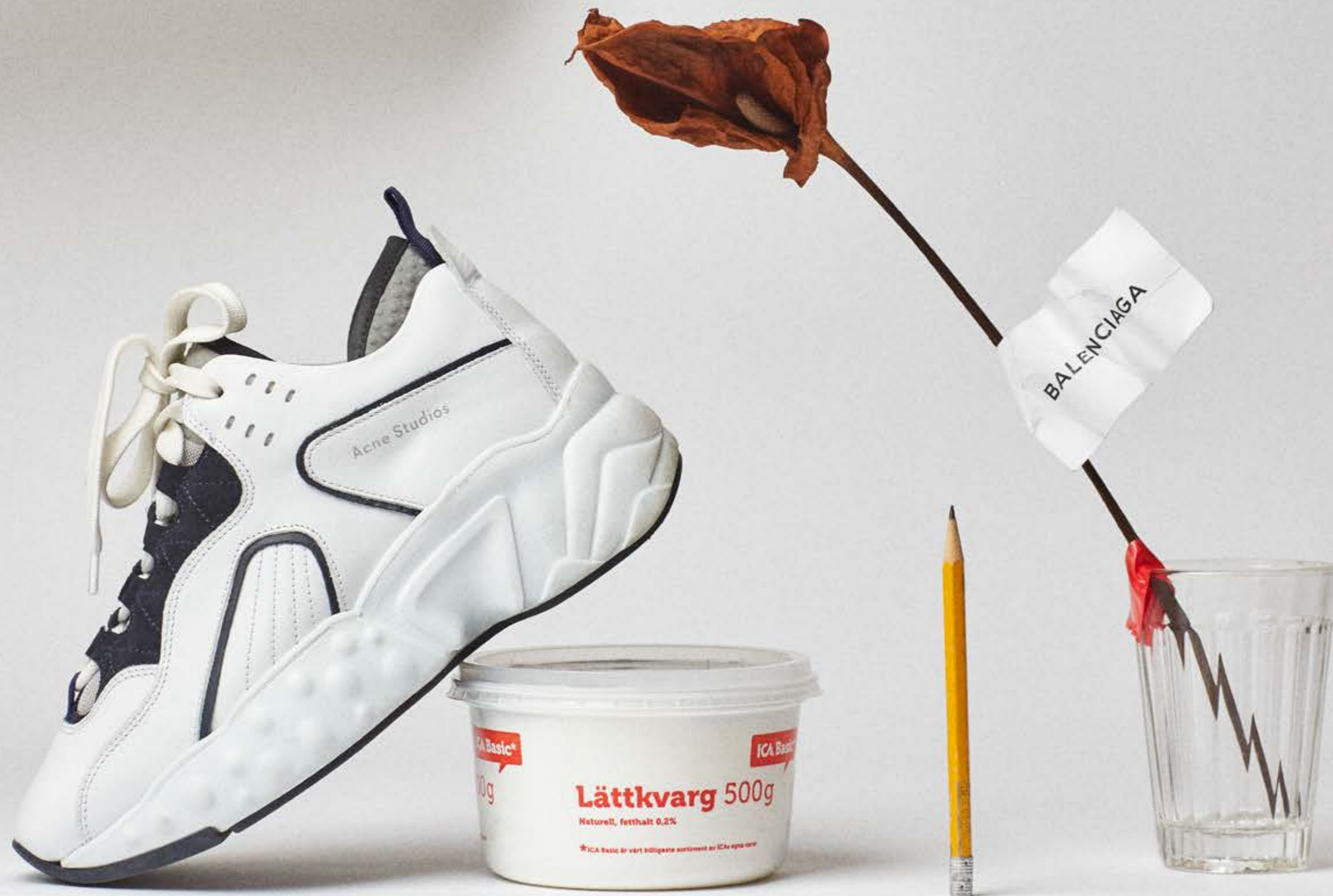
EXTRACT FROM STILL LIFES ARTICLE.