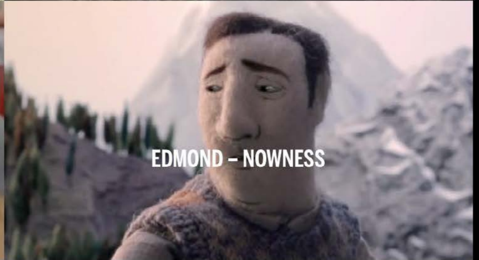
EDMOND – NOWNESS