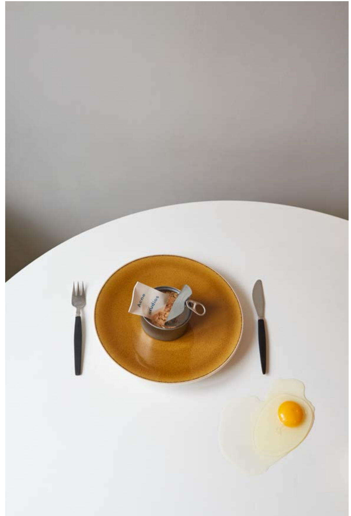
EXTRACT FROM STILL LIVES ARTICLE.