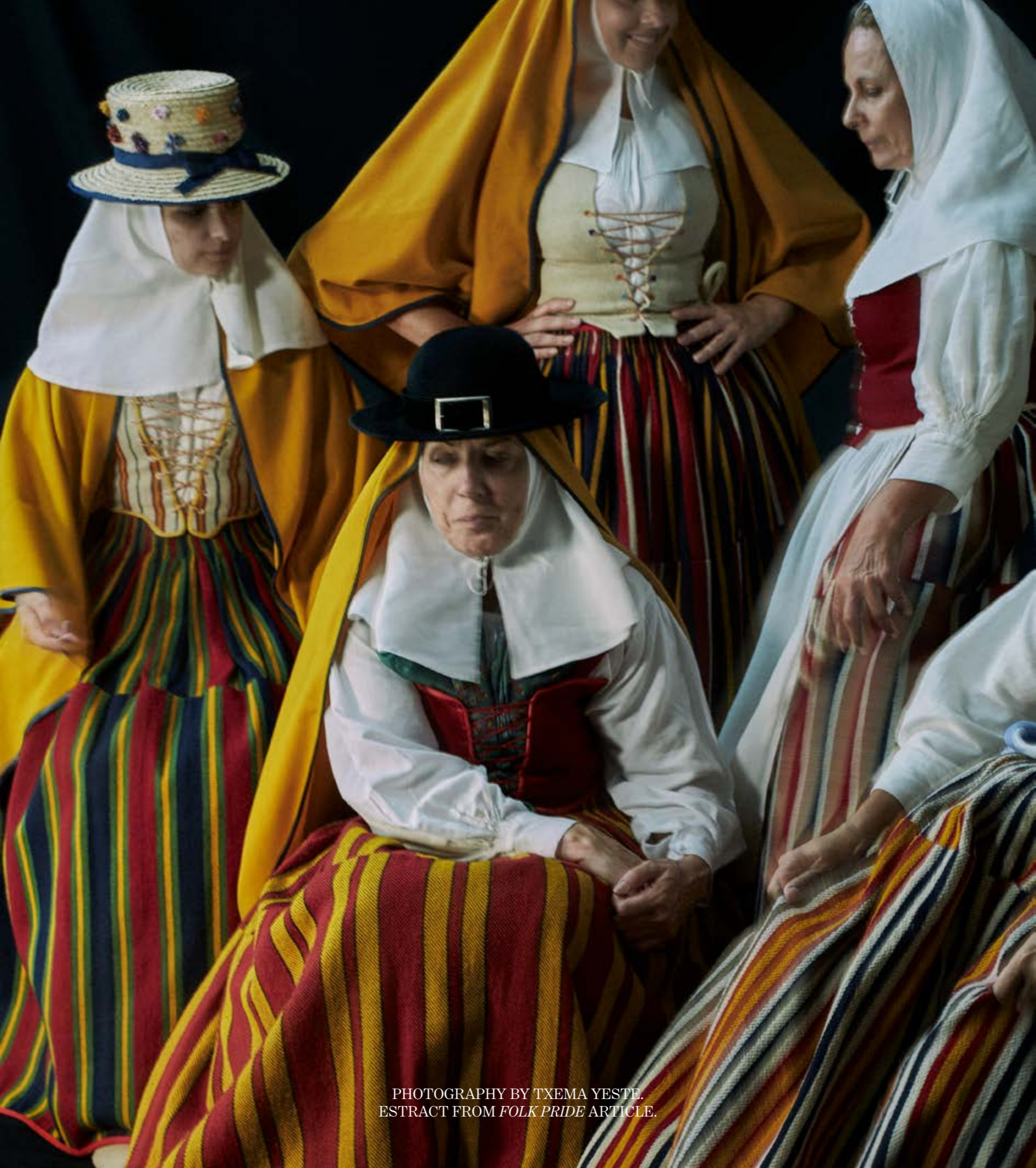
EXTRACT FROM FOLK PRIDE ARTICLE.