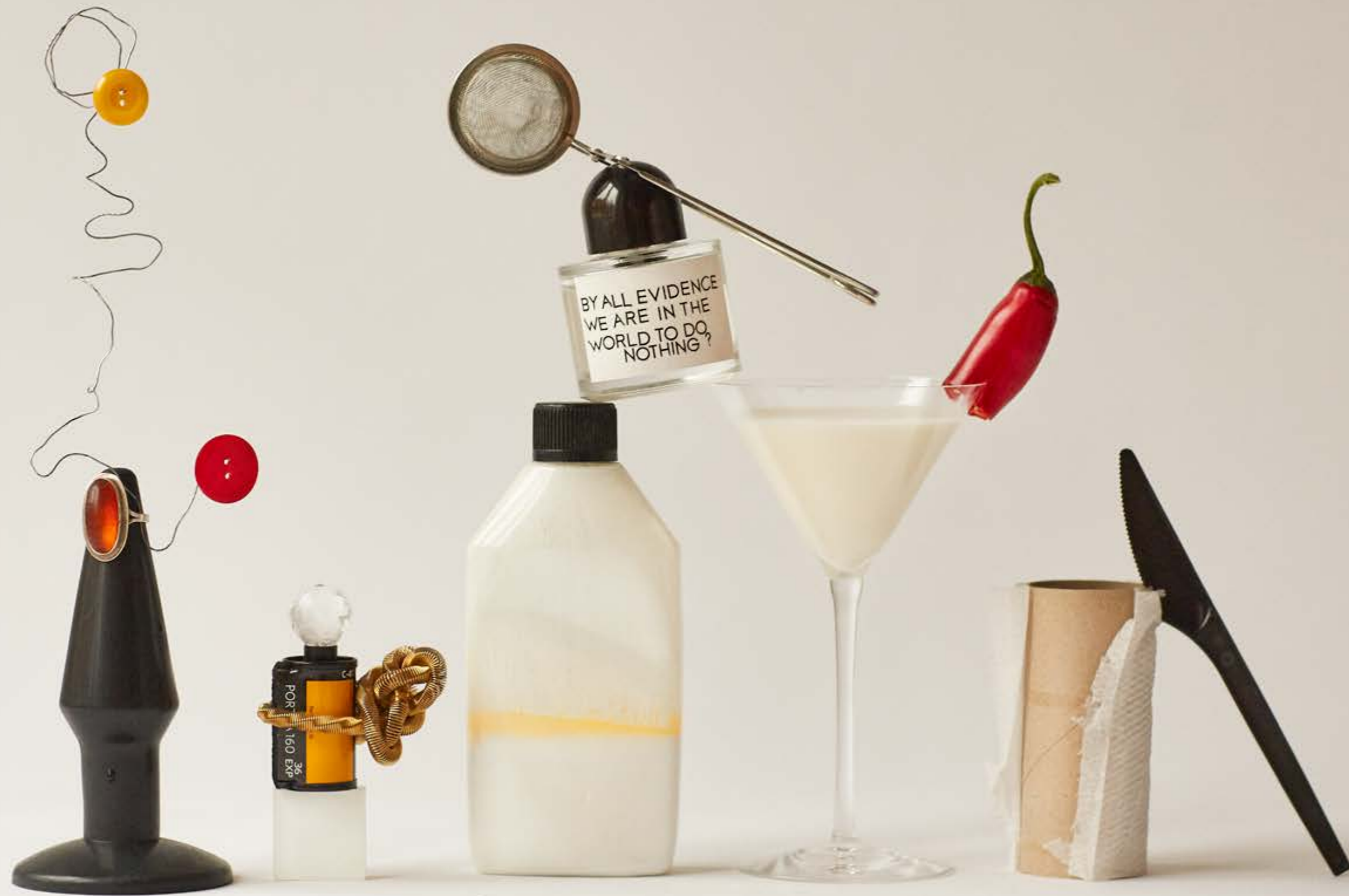
EXTRACT FROM STILL LIVES ARTICLE.