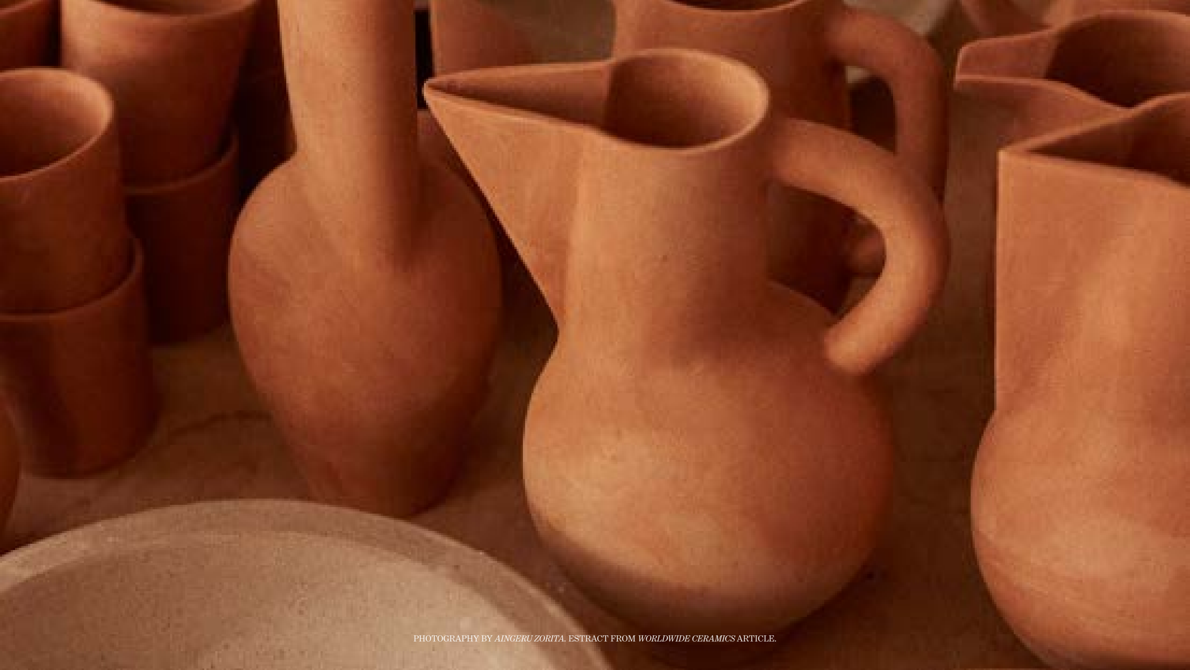
EXTRACT FROM WORLDWIDE CERAMICS ARTICLE.