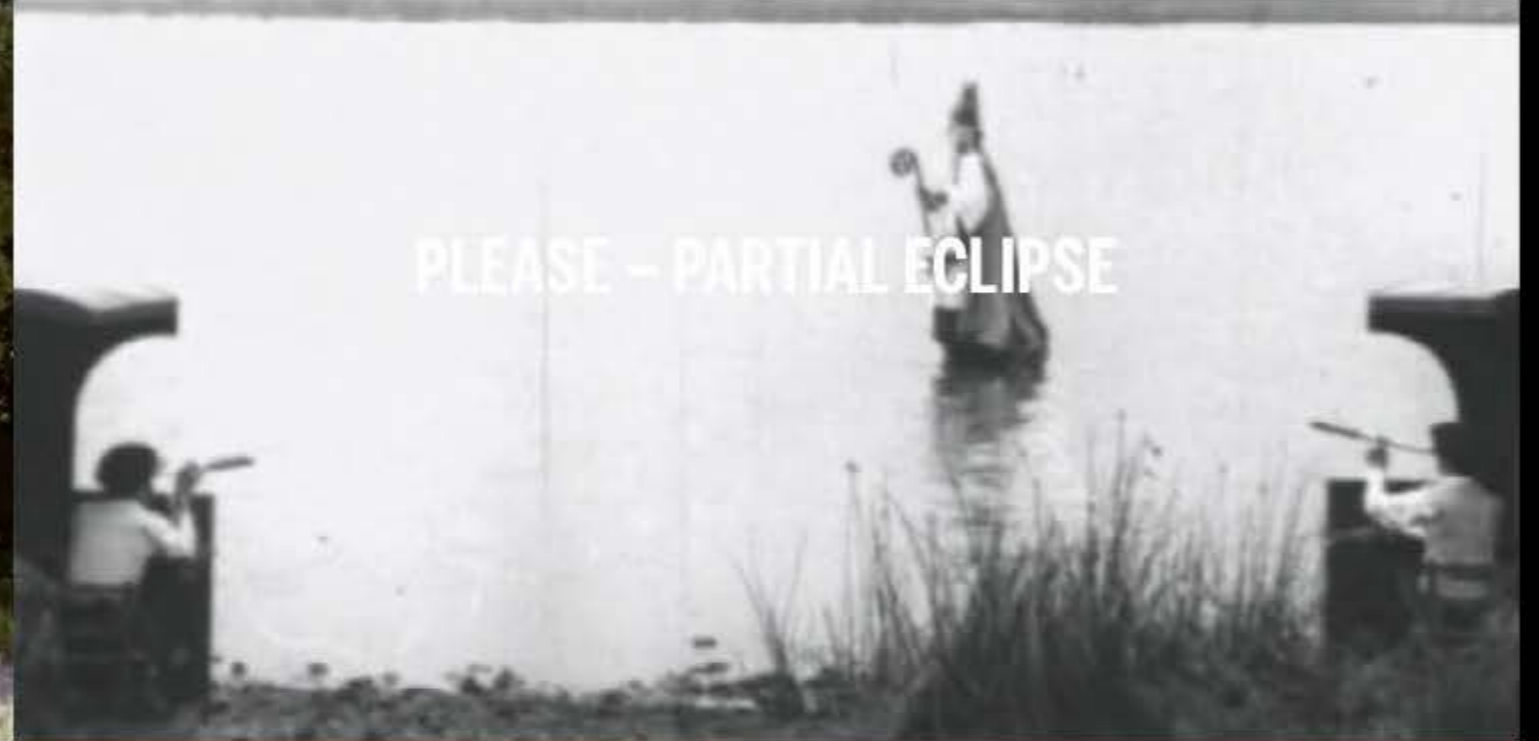
PLEASE – PARTIAL ECLIPSE