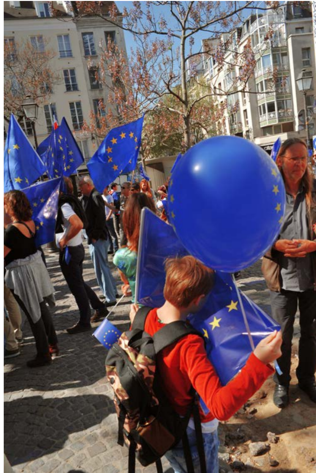
EXTRACT FROM STILL LIFES ARTICLE.