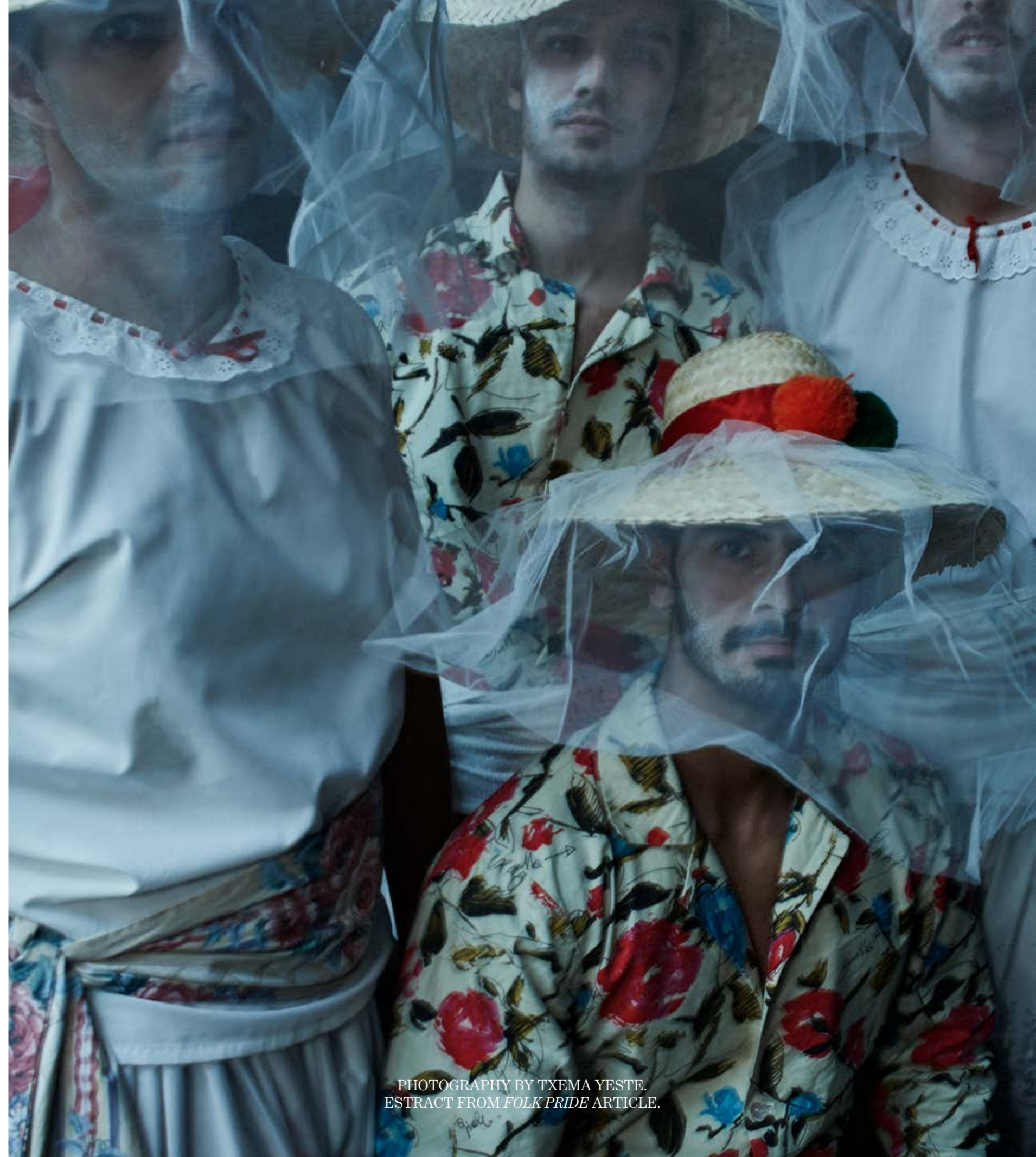
EXTRACT FROM FOLK PRIDE ARTICLE.