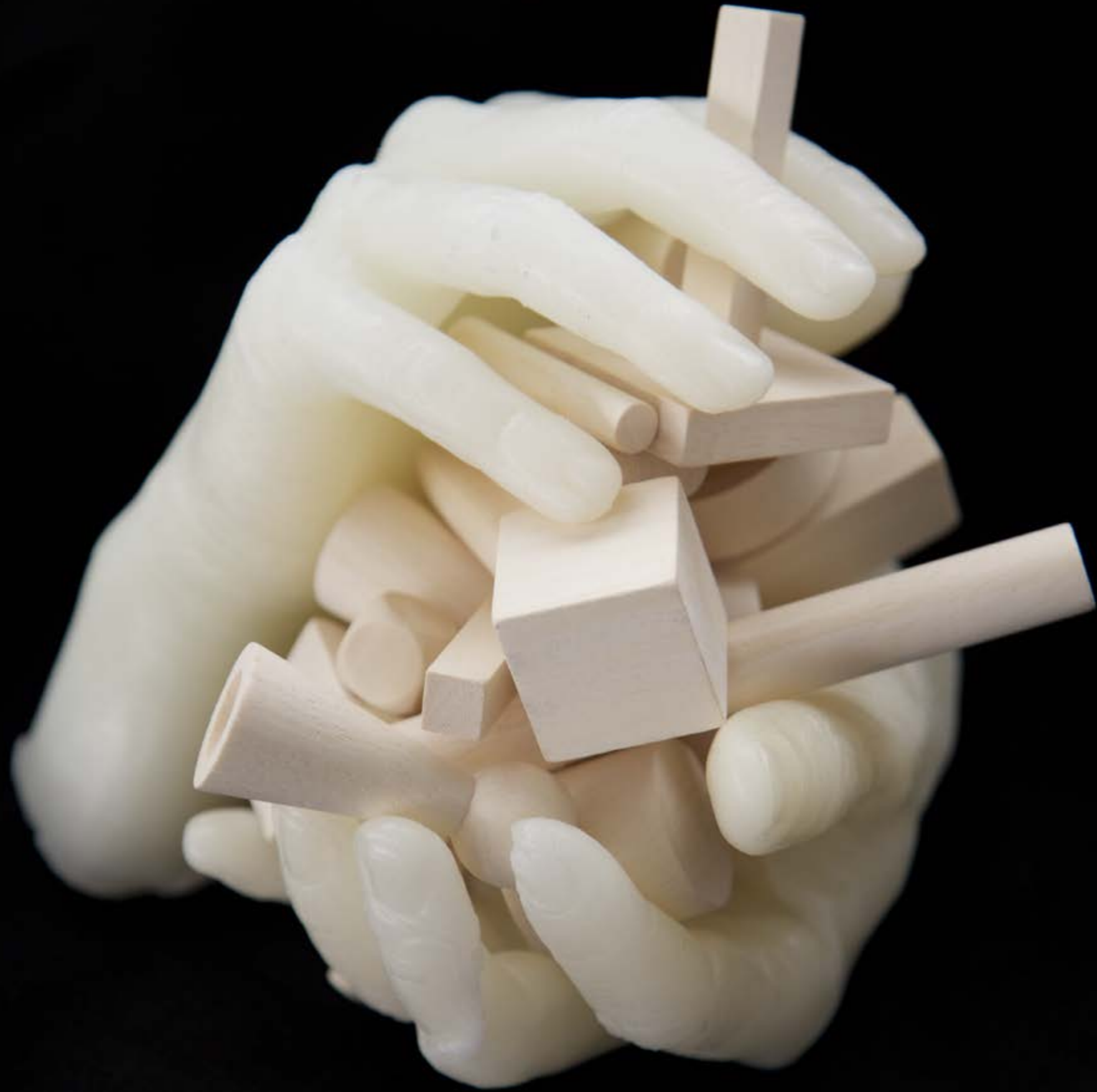
EXTRACT FROM STILL LIVES ARTICLE.