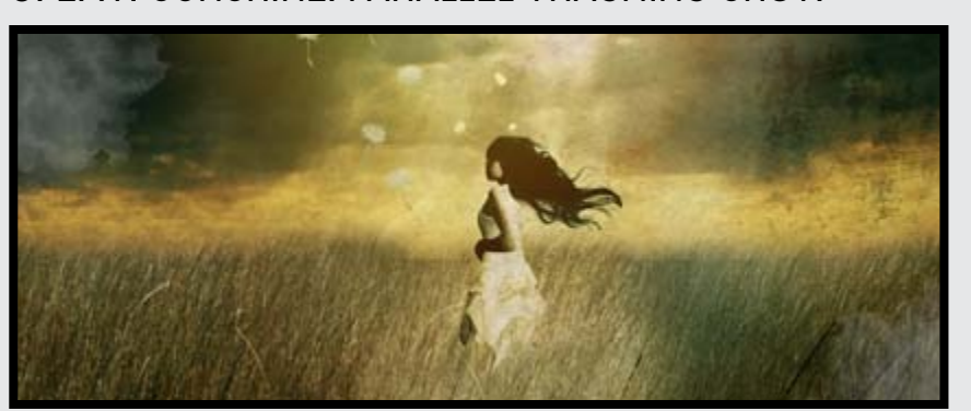
7. EXT. NIGHT. CRANE SHOT.