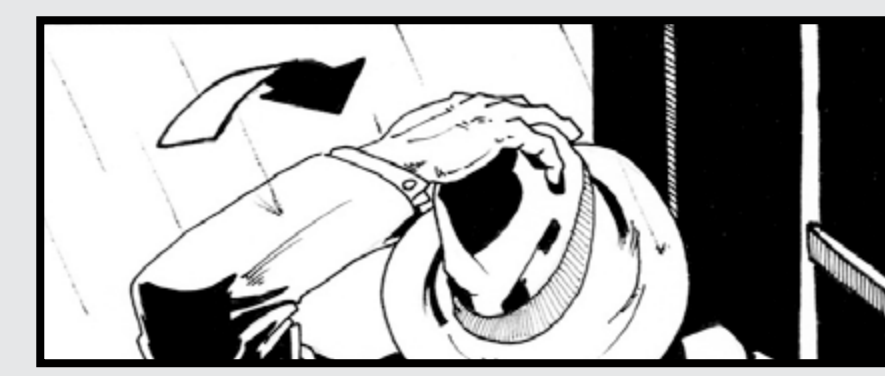
8. FADE TO BLACK. THANKS FOR YOUR TIME!