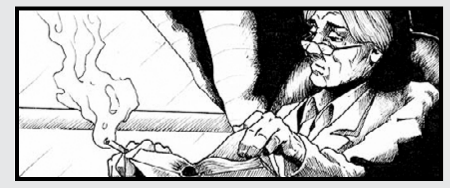
3. EXT. NIGHT. SHOT ON SET. EXTREME CLOSE UP.